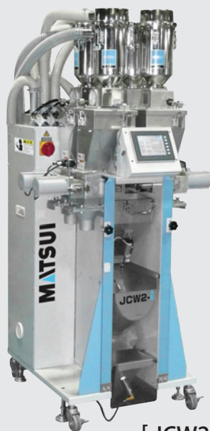
[ JCW2 - i - 05 ]

Overview The JCW blending system is equipped with Matsui’s iplas intelligent controls. The Intelligent Control function continuously monitors usage, and automatically optimizes operation for accuracy and speed.