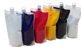
Liquid Color Pouches

A product powered by technical cooperation with Toyocolor Co., Ltd.