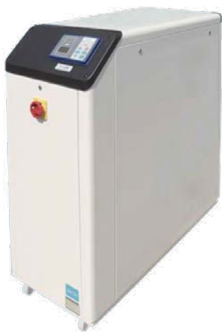
[ RCD180 / 24 ]

Controls from the chiller will ratio and improve efficiencies of the system.