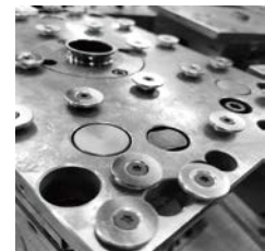
Insulation 'TamaGON' parts

Mold mounting plate: 220mm x 150mm / Mold temperature: Actual value at 140°C