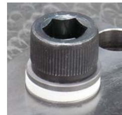
For mold mounting bolts insulation washer