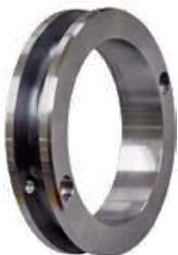
Insulated locate ring