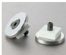
Insulation 'TamaGON' parts

The combination of newly developed insulation parts 'TamaGON', insulation washers for mold mounting bolts, and insulation locating rings greatly suppresses heat leakage from the mold.