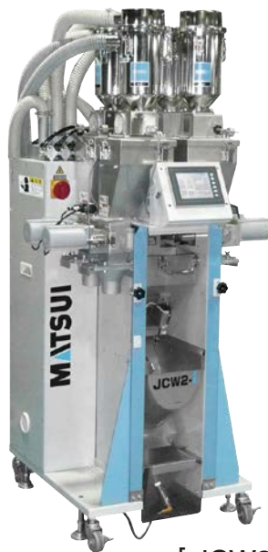
[ JCW2 - i - 05 ]

The JCW blending system is equipped with Matsui's iplas intelligent controls. The Intelligent Control function continuously monitors usage, and automatically optimizes operation for accuracy and speed.