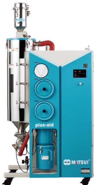
[ MJ6-i-G3-30 ]

An intelligent dryer with proprietary developed self-control (iplas control) function. This enables control of the amount of dry air or recycled air to suit the amount of resin used by the molding machine. Supplying resin in the optimum condition results in stable plasticizing and prevents yellowing.