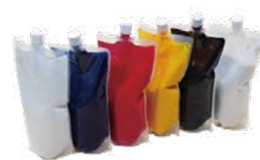
Liquid Color Pouches

A product powered by technical cooperation with Toyocolor Co., Ltd.