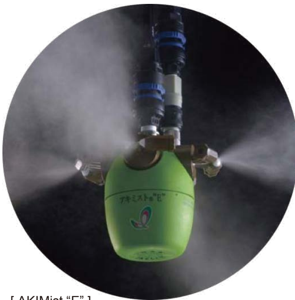
[ AKIMist "E" ]

Moisture controlled air also limits the amount of floating dirt or dust, and provides approx. 2°C of cooling effects in hot weather. This helps to reduce cooling loads and save energy.