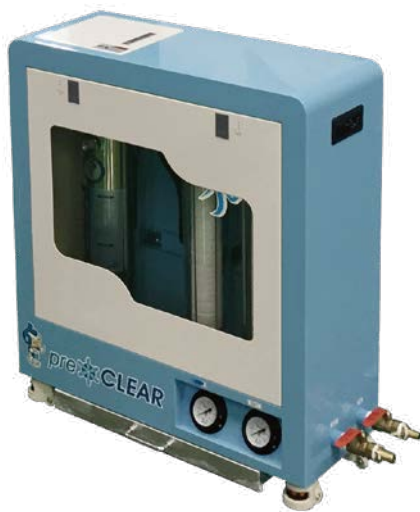
[ preCLEAR ]

Water softener consisting of a filter to remove suspended substances that cause corrosion to progress, and an ion exchanger with filter to remove scale deposits. Ensures reliable production and helps extend the operating life of cooling lines.