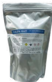
Aluminum bag type