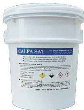
Resin pail can type