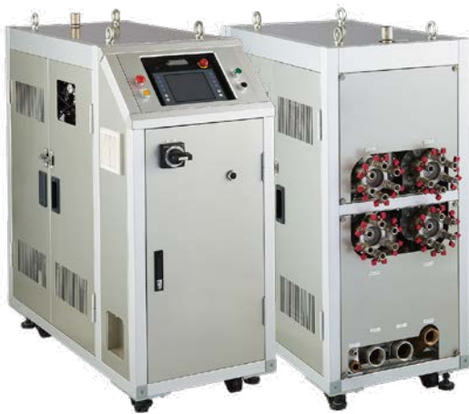
RHCM2-100G (1 Circuit)